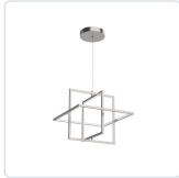
PD16320-BN Brushed Nickel